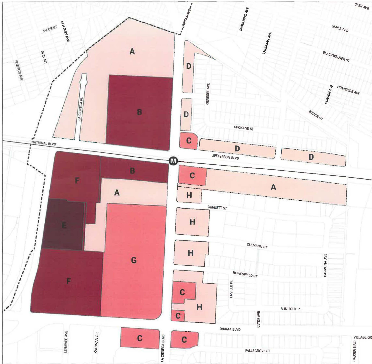
Figure V-2 Subarea Height Map